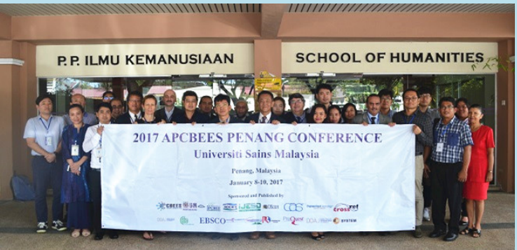
ICGCE 2017 Penang, Malyaisa | January 8-10, 2017