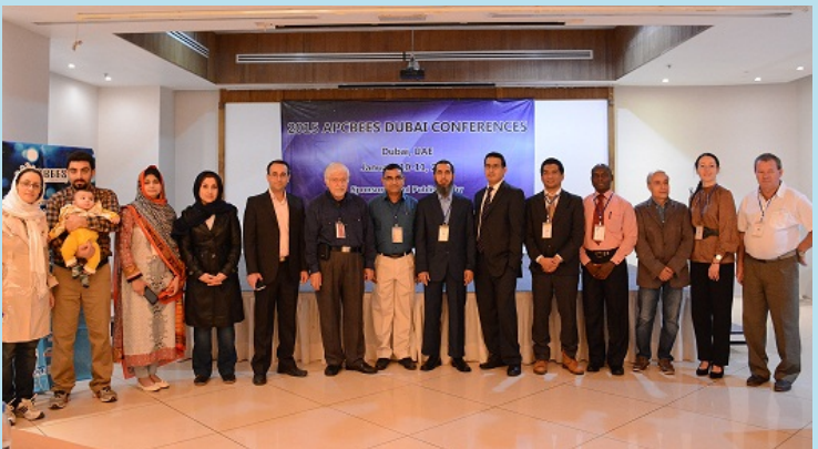
ICGCE 2015 Dubai, UAE | January 10-11, 2015