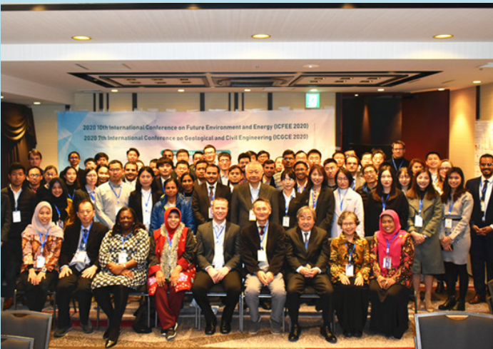
ICGCE 2020 Kyoto, Japan | January 7-9, 2020