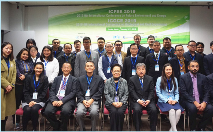
ICGCE 2019 Osaka, Japan | January 9-11, 2019