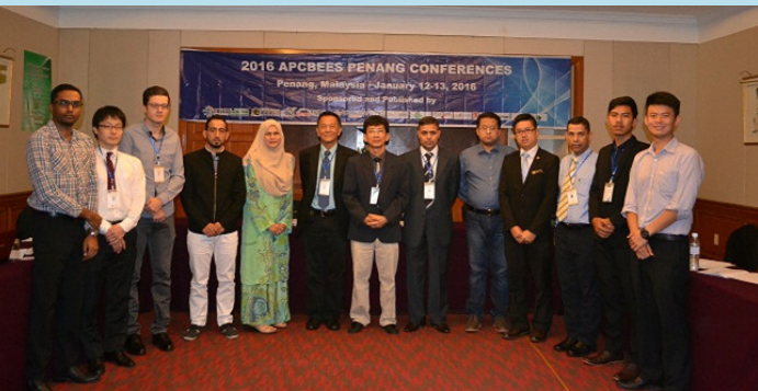
ICGCE 2016 Penang, Malyaisa | January 12-13, 2016