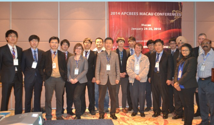
ICGCE 2014 Macau, China | January 24-25, 2014