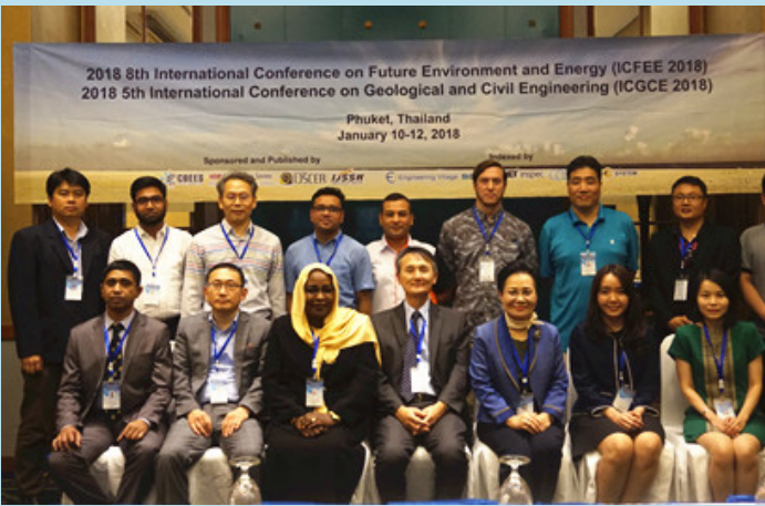
ICGCE 2018 Phuket, Thailand | January 10-12, 2018